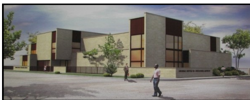
Branch 11 Headquarters: James E. Worsham Building